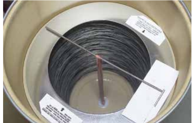
Inside view of wire in X-Pak drum