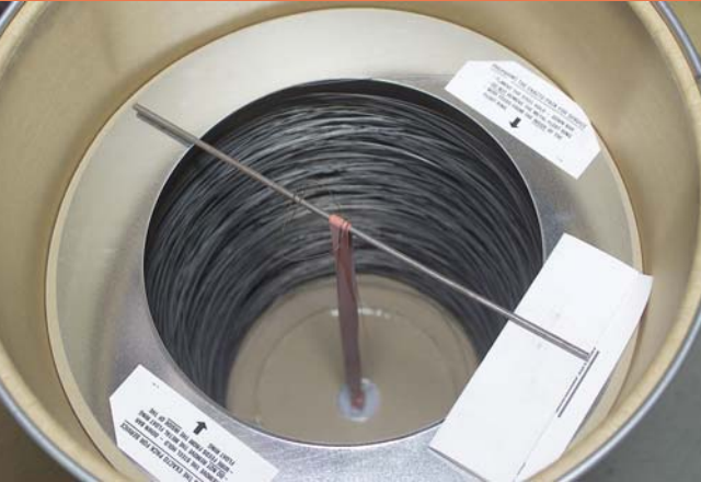
Inside view of wire in X-Pak drum